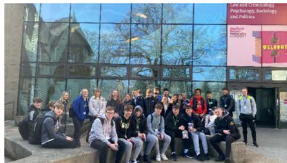
Sheffield Hallam University – Yr12 BTEC Sport students