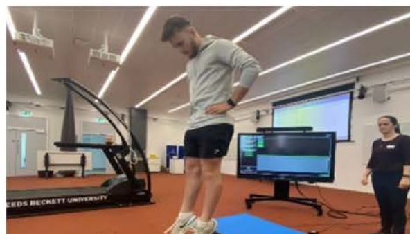
Leeds Beckett trip for Sport students