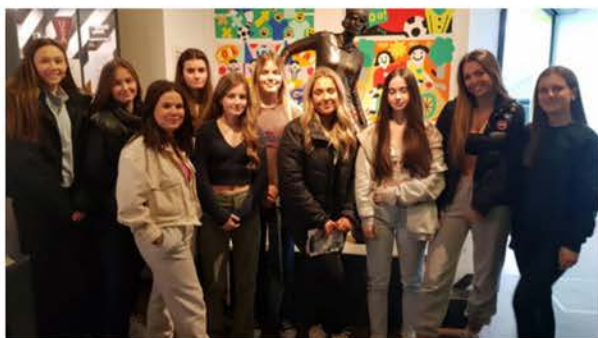
National Football Museum – women's football 1st team