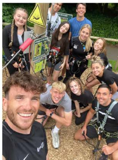
Go Ape – Yr12 and Yr13 Sports ambassadors