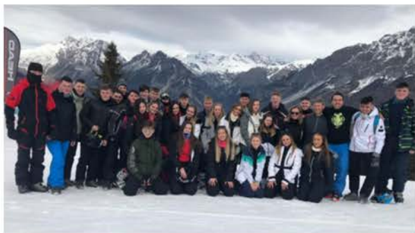
Bormio ski trip – February 2022 – 48 Yr12/13 students