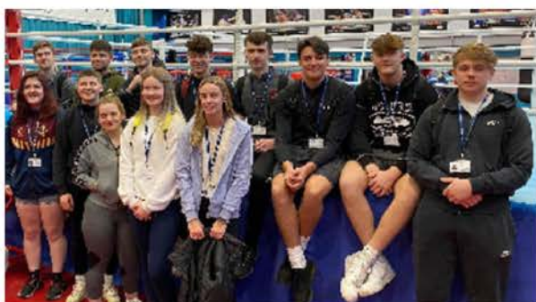
EIS Sheffield – Yr13 Diploma and Extended Diploma in Sport students